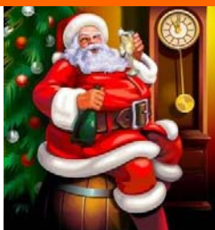
Merry Christmas and Happy New Year

31 Jan - 6 Feb, 2011 USPS Annual Meeting Disney's Coronado Springs