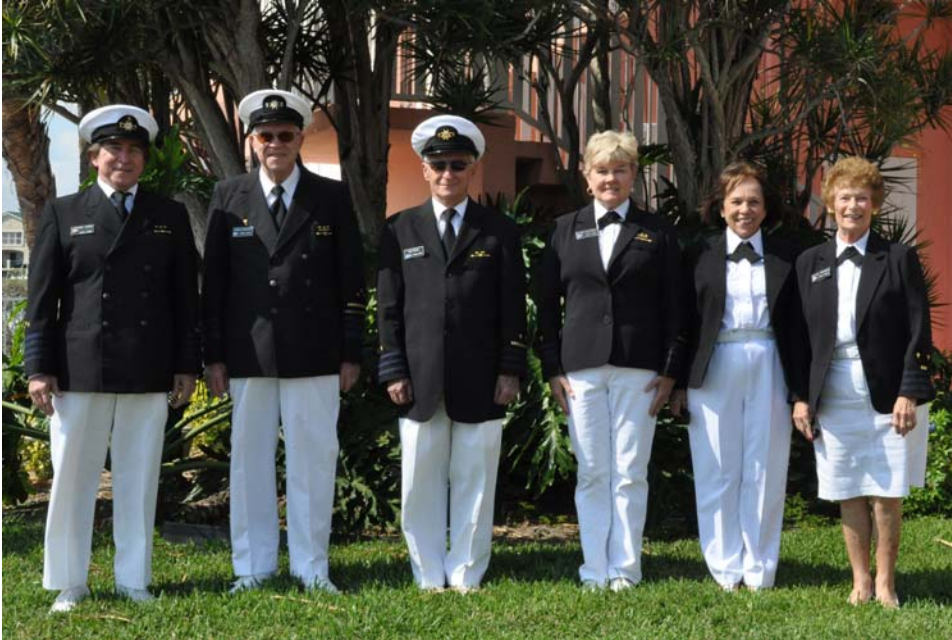
Our New Bridge