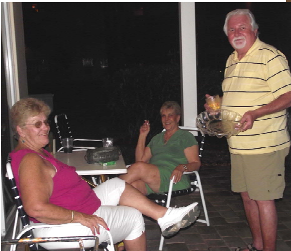
50's Halloween Party!