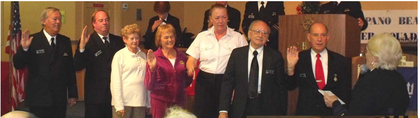
Executive Committee for 2011