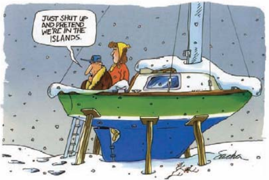
© Copyright 2009 Cartoons by Sacha. If you liked this cartoon, check out Sacha's "Underway" collection at www.boatingcartoons.com .