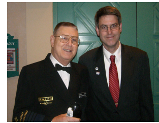
C/C and NOAA's Weeks

What we are trying to do is move away from some of the dull Thursday administrative meetings to more instruction and seminars. (continued on Pg 3)